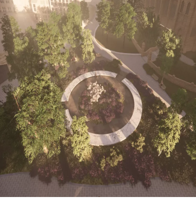
Glade of Light