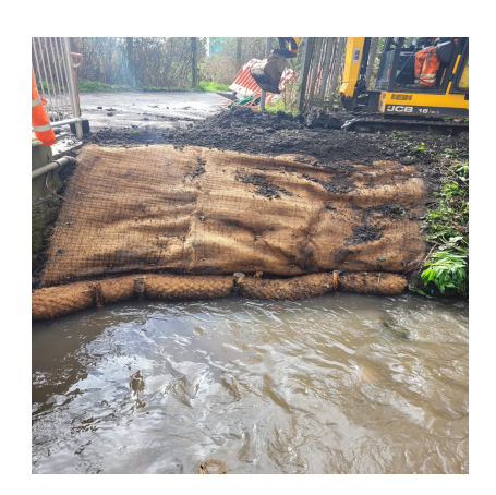
Moat Coir Mat Install