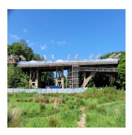
Queens Park Road Bridge