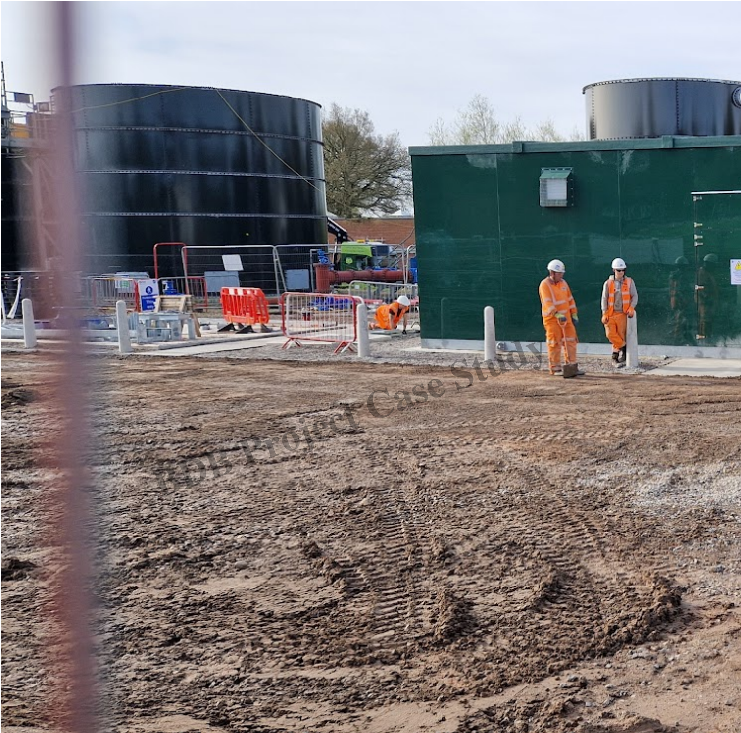
Water Treatment Plant