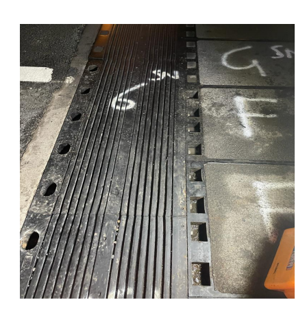
Thelwall Maintenance 2023